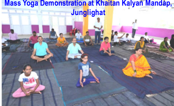
Mass Yoga Demonstration at Khaitan Kalyan Mandap, Junglighat