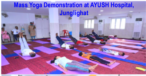
Mass Yoga Demonstration at AYUSH Hospital, Junglighat