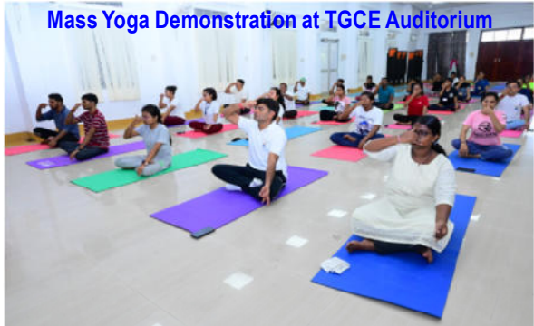
Mass Yoga Demonstration at TGCE Auditorium