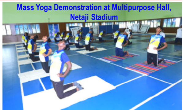
Mass Yoga Demonstration at Multipurpose Hall, Netaji Stadium